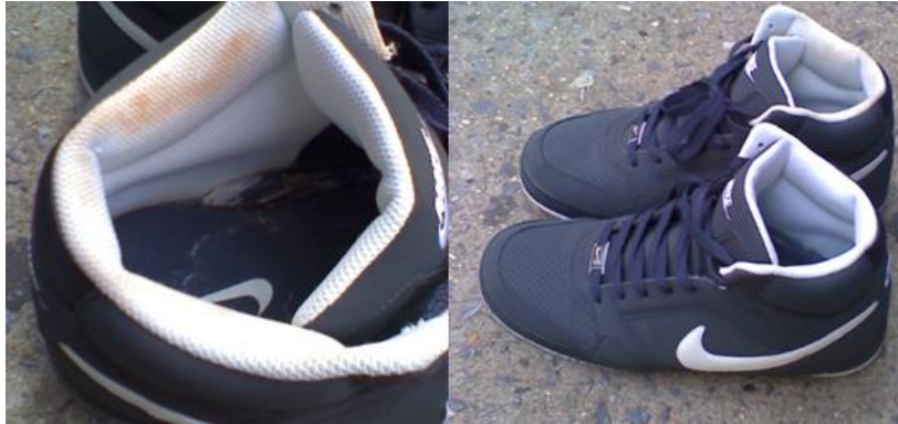
(U//DSEN) Figure 2: Heroin Secreted in Sneakers