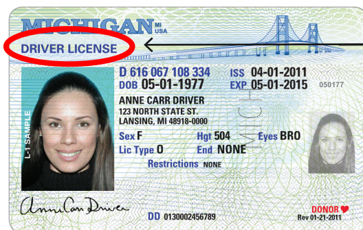
Younger Than 21 Format Driver's License